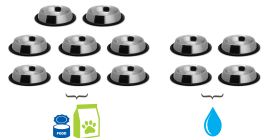
Washing/Sanitizing Task Per Guest, Average 4-day Stay

12 ordinary stainless steel bowls vs. 2 Kleanbowl frames